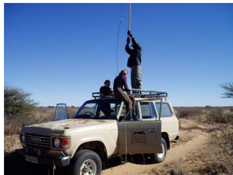
Our tracking vehicle 'the beast'